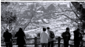
ISHINOMAKI AFTER 2011 TSUNAMI QUAKE MIYAGI PREFECTURE —A picture combo shows (bottom to top) tsunami survivors look over the tsunami-devastated area of Ishinomaki in Miyagi Prefecture, northern Japan, March 13 2011. The same view one year later on February 13 2012, and on February 19 2021 (issued March 9 2021). March 11 marks the tenth anniversary of the 9.0-magnitude earthquake and subsequent tsunami that devastated northeastern Japan and triggered a nuclear disaster at the Fukushima Daiichi Nuclear Power Plant.