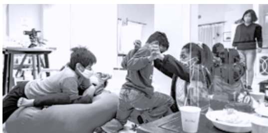
GATHERING OF FUKUSHIMA EVACUEES

The Budget Committee members also confirmed that the ministry will submit an interim report on its investigation on the scandal in line with the intensive deliberations.