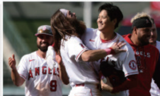
ANGELS EDGE NATIONALS IN ANAHEIM

Through the series of talks, Hayashi hopes to confirm with Yoon's administration that Japan and South Korea will continue to communicate well with each other given that Yoon's side seems to be eager to mend the frayed bilateral relations.